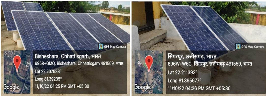
Pic: - The Solar Panels grid planted on the roof top of the college for an alternative source of Energy.